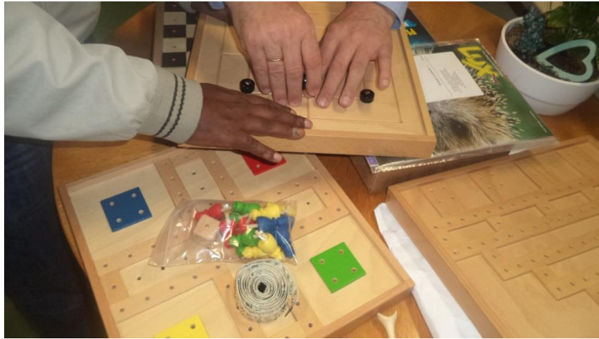
Image: Tactile adaptations of popular board games produced at the Bundes-Blindenerziehungsinstitut (Institute for the Blind)

extend community service to the local community in Gedio zone and on how the 2 parties stand for mutual benefit in identifying short and long term needs and interests.